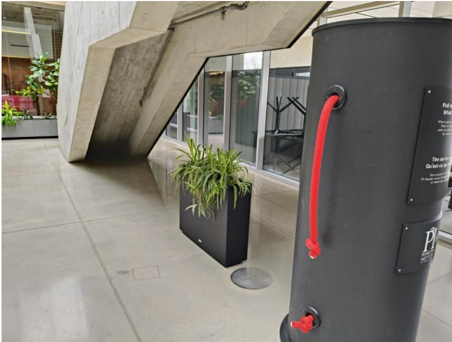
Under Atrium Staircase: Main