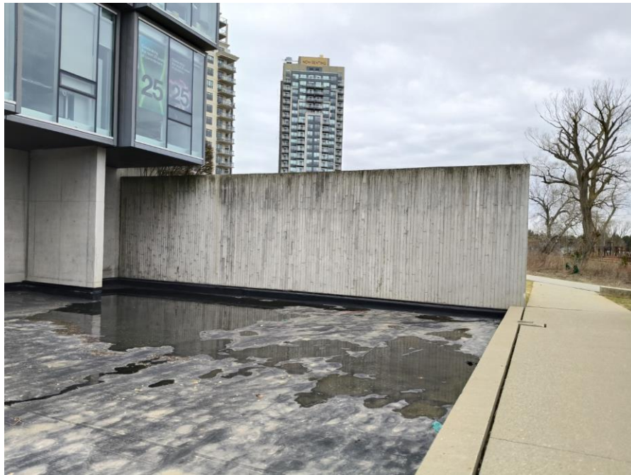
Reflecting Pool Wall: Main