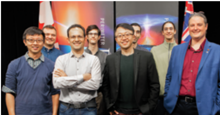
EHT Initiative at Perimeter