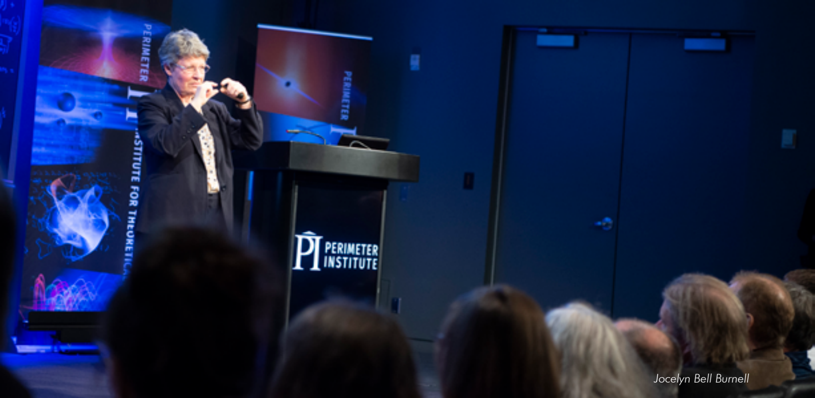
Jocelyn Bell Burnell